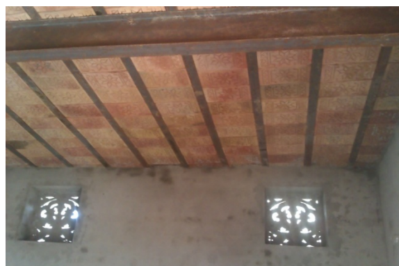
Internal Condition of Room