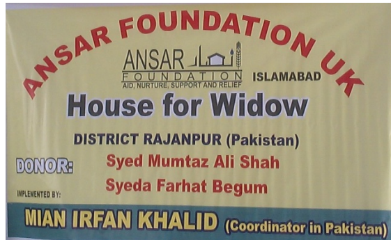
Donor Name Plate