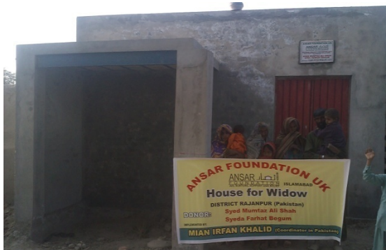
Widow with her disabled brother and his family