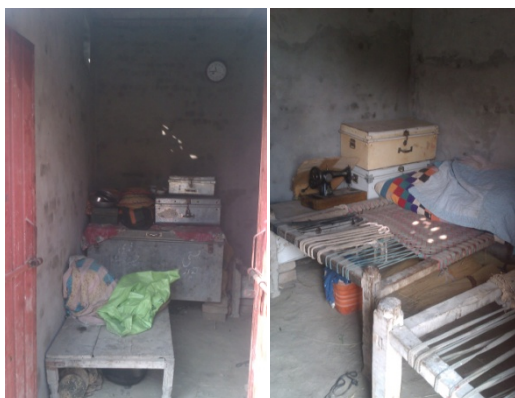
Internal Condition of Room