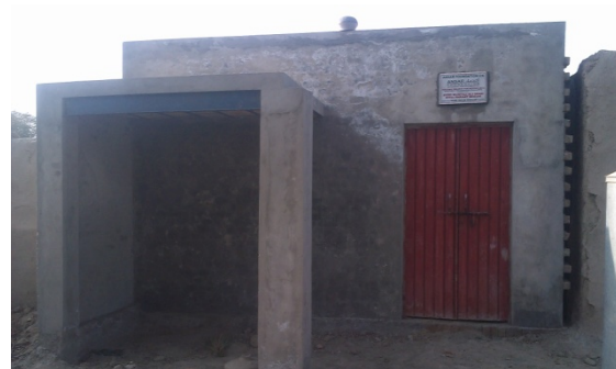
Photo of completed house