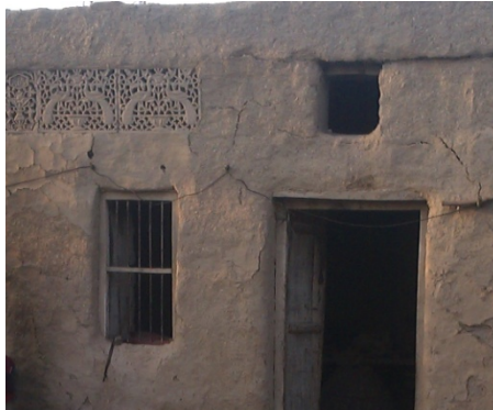
Prior accommodation (living with disabled brother and his family)